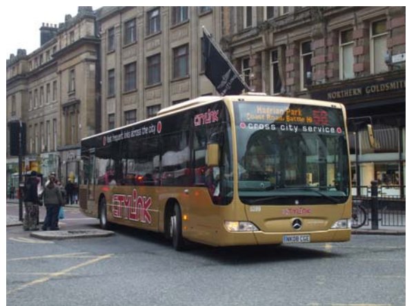
Here is a new Go North East Citaro 5289 (NK08CGE) now with its "Citylink" branding applied