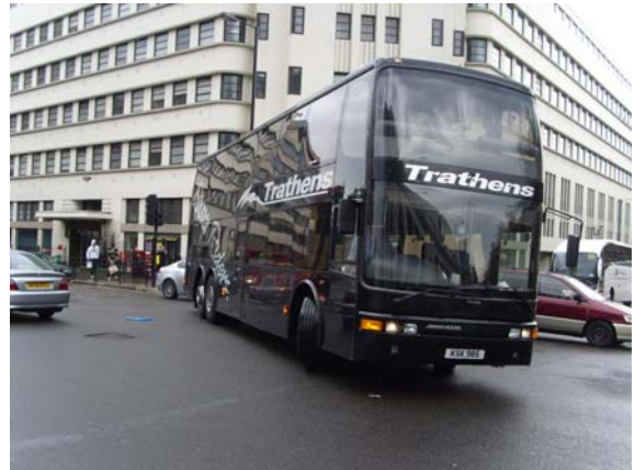
A Jonckherre bodied Volvo of Trathens working a Sunday extra for National Express KSK985