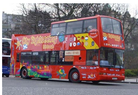
One of the part open top Lothian Dennis Tridents on City Sightseeing duties in Edinburgh 506 (T506SSG)