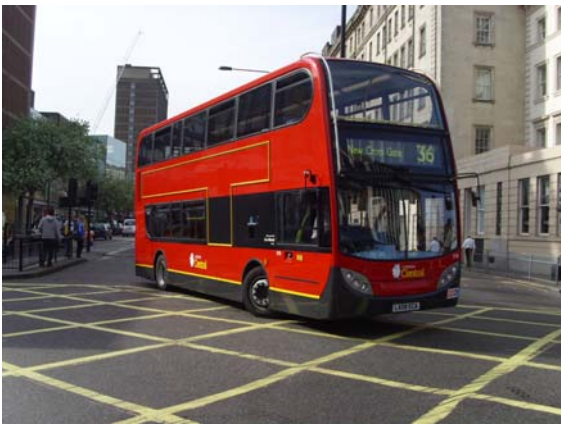
One of the new Enviro 400s E98 of London Central for the 436