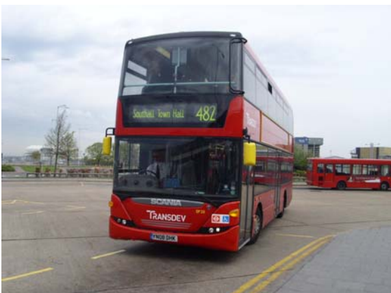
A brand new Scania Omnilink SP24 (YN08DHK) of Transdev London United seen here at Hatton Cross working new route 483