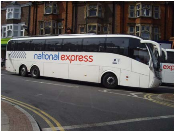
You can really tell the length of the new Caetano Levante SC37 from this angle.